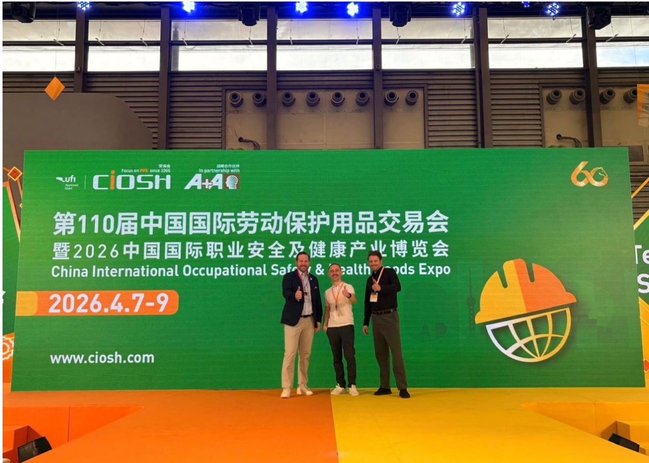
Fraunhofer IPA at CIOSH 2026 in Shanghai.

From a robot-served coffee on arrival to an exoskeleton catwalk at EXO Park, Fraunhofer IPA's visit to CIOSH 2026 offered a front-row view of how occupational exoskeletons are being introduced and discussed in China.