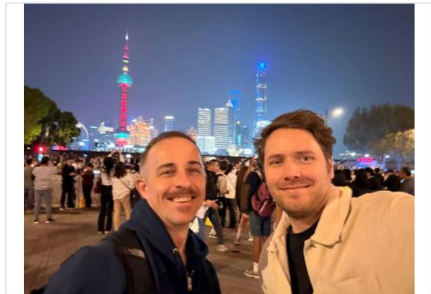
Shanghai moments around the trip: arrival, old-city streets, cityscape, and the skyline at night.